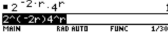
Figure 3: T.I.C.A.S. produces 1 directly from 2^{-2r}4^r .